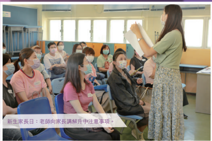
新生家長日：老師向家長講解升中注意事項。