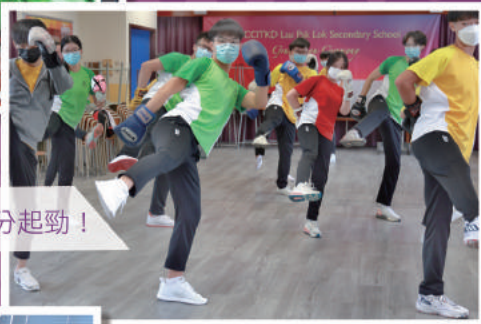
泰拳體驗——同學踢得十分起勁！