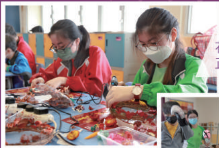
花環製作活動——同學們正以熱熔槍製作花環。

經過這次活動，我學習到更多關於護膚品中的成份，以及以較低成本自製護膚品。我希望下次也能參加更多不同的學會。