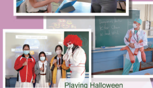
Playing Halloween Kahoot Quiz in the lesson