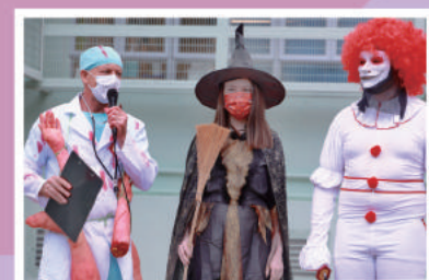
Introducing the Halloween activities in the morning assembly