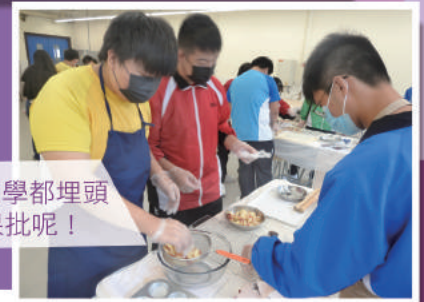
烹飪學會——同學都埋頭苦幹地製作蘋果批呢！