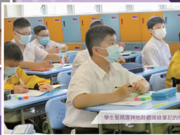
學生聚精匯神地聆聽摘錄筆記的技巧。