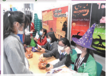
Halloween Game Booths