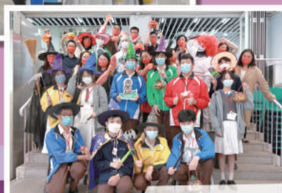
Halloween is fun!