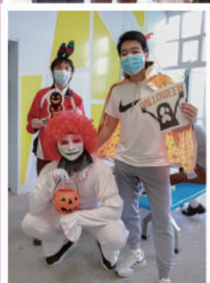
Meeting the scary clown